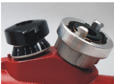
Variable proportioning between 1% and 6%.